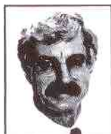
JUDGE ALAN M. AHART U.S. Bankruptcy Court Central District of California